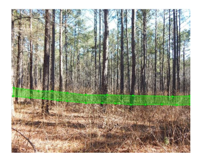
c) Three-years fire return interval

Figure 2: Results of box-counting analysis for fire return interval groups of prescribed fire management and grass cover in loblolly pine stands on the Mary Olive Thomas Demonstration Forest near Auburn, AL.