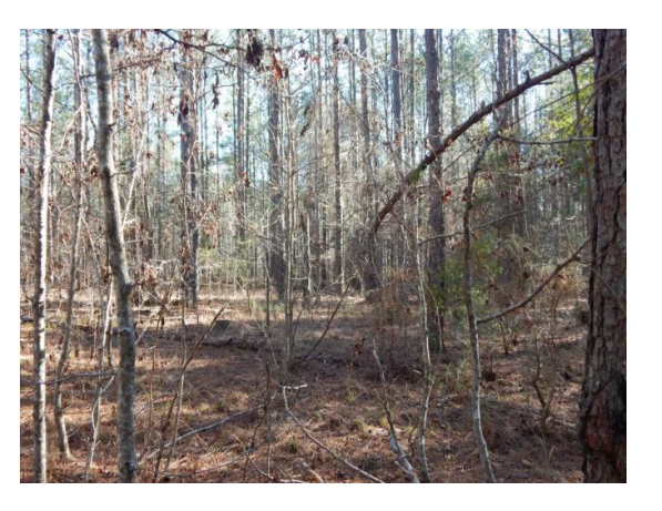
d) Absence of prescribed fire management

Figure 1: Fire return interval groups of prescribed fire management and grass cover in loblolly pine stands on the Mary Olive Thomas Demonstration Forest near Auburn, AL.