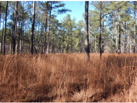
b) Two-years fire return interval