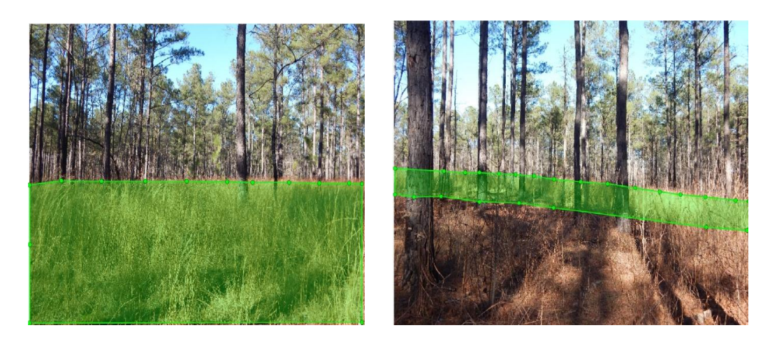
a) One-year fire return interval

The results of the box-counting analysis showed that there was a significant difference among the prescribed fire treatments for one year interval (Figure 2-a), two years interval (Figure 2-b), three years interval (Figure 2-c) and no burn (Figure 1-a). Pixel number calculation results (Figure 3) showed that the highest rate of grass pixels was 7,439,096 for one year interval, while it was found as 1,974,311 for two years and 901,885 for three years fire interval. The pixel calculation score was derived as 0 for no burn photographs due to absence of grass. The results of box-counting pixel numbers showed that one-year FRI application stands were more abundant with grass cover than two and three years FRI (Figure 3). Furthermore, the analysis showed that there was a significant decrease in grass cover between one year and two years prescribed burning.