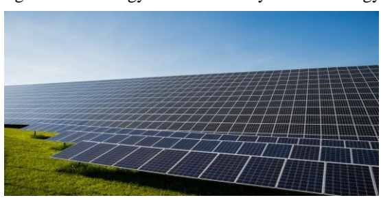
Fig.3 - Solar energy the eco-friendly form of energy.

Technology has affected all the aspects of social world, environment is one of them. A good environment belongs to a good society. In modern time people of India suffer too much by the environmental pollution which has become