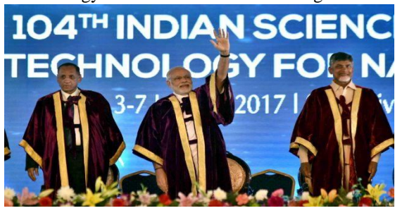
Fig. 7 - Technology becomes mediator between government and society