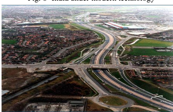
Fig. 6- India under modern technology